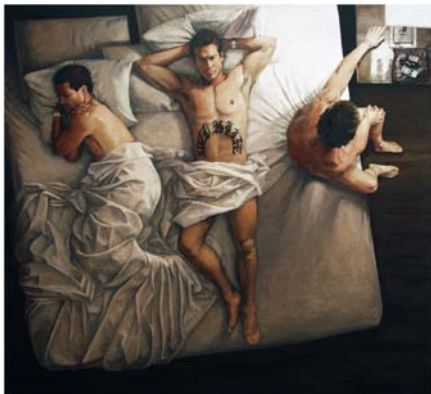
Completed January 2009

This painting was successful in reaching the finals of the Archibald Art Prize 2009