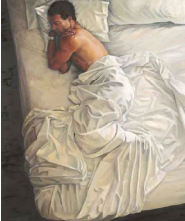
Completed November 2008