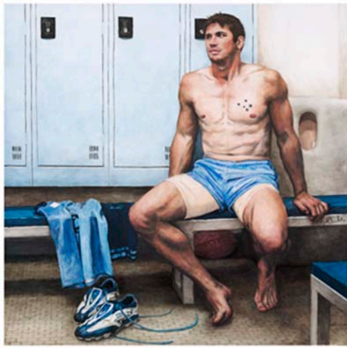
"Locker Number 7" – Brant Chambers, Sturt FC Watercolour and oil Glazes on Paper 100 x 100 cm