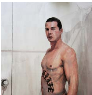
Title: "Shower 1" and "Shower 2" - Detail Watercolour on Paper 52 x 62 cm each

This painting was successful in reaching the finals of the Archibald Art Prize 2009